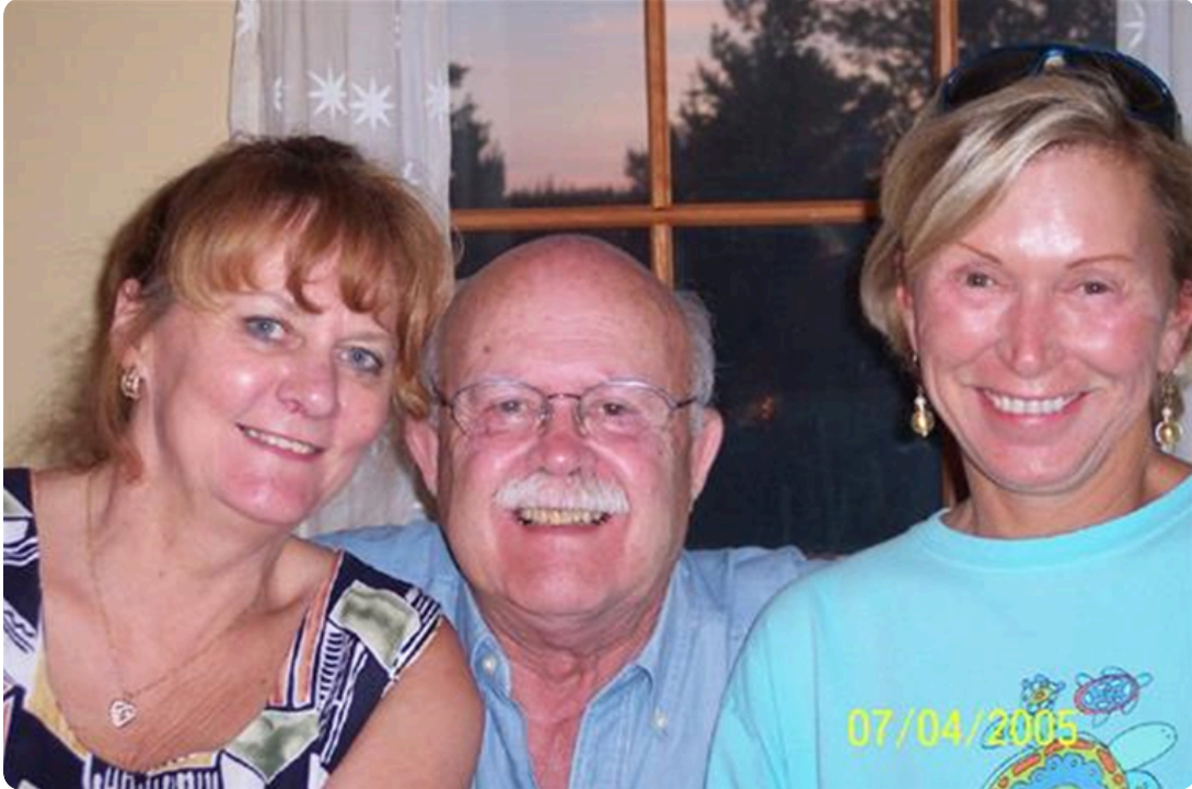
Happy times in Newfoundland & Labrador